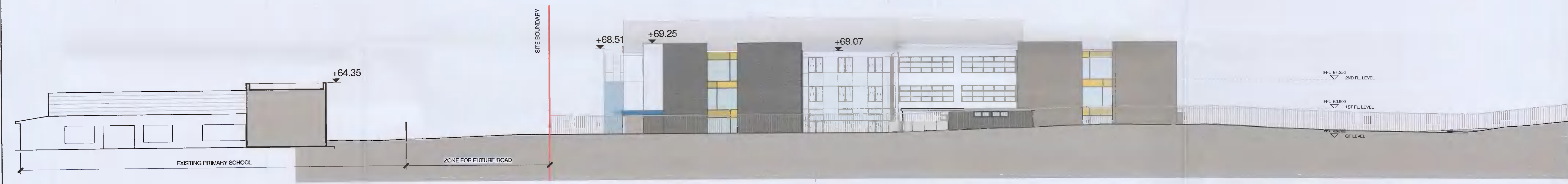
4 Section CC 1:250