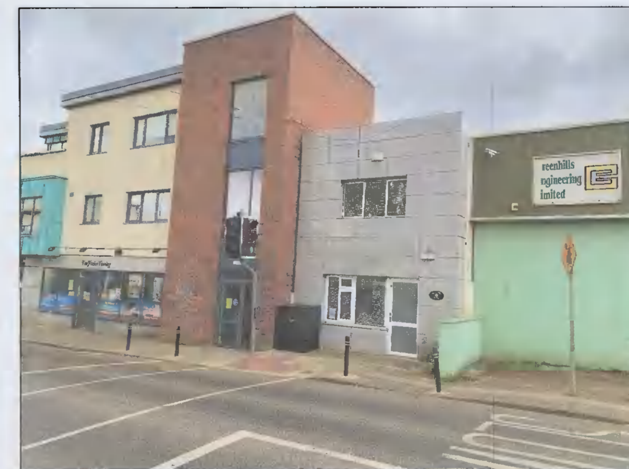
EXISTING STREET PHOTOGRAPH OF MILLSTONE, HOUSE, OLD NANGOR ROAD, D22