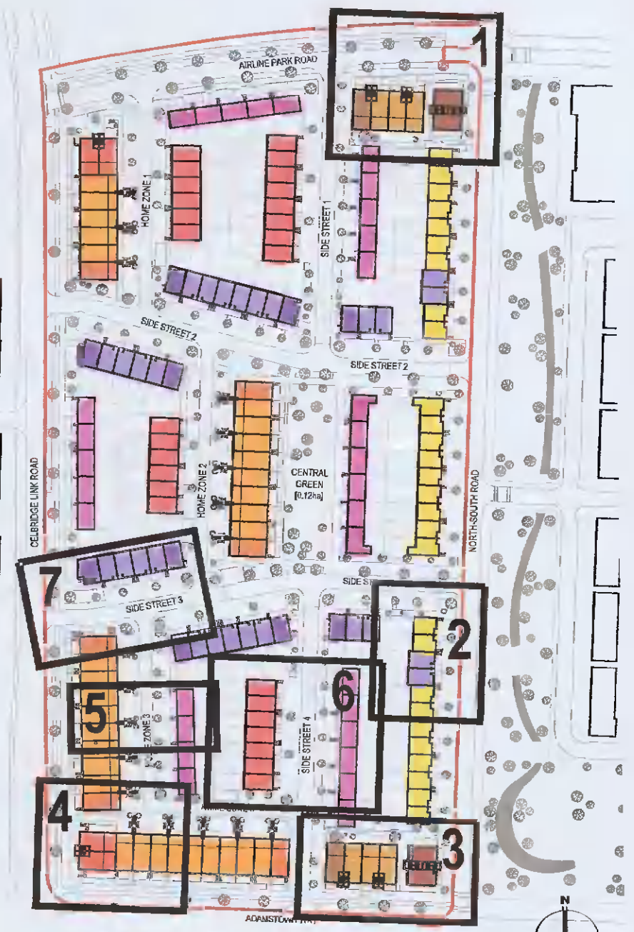
00 Keyplan Not to scale