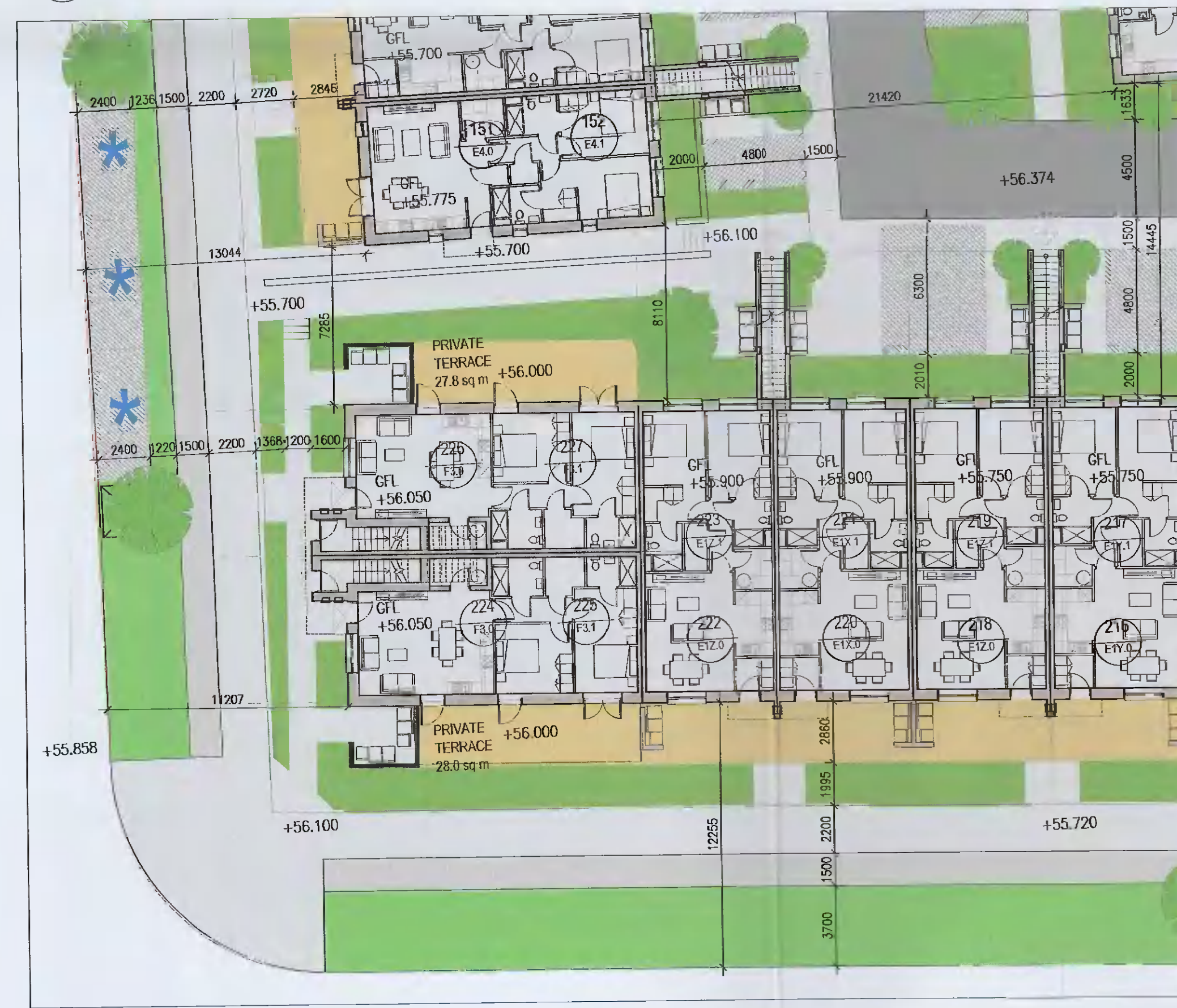
4 Block Plan 4 P301 1:200 @ A1