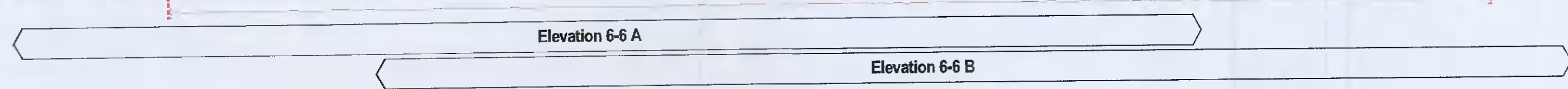
6-6 Proposed Street Elevation 1:500 @ A1 SIDE STREET 2 - SOUTH