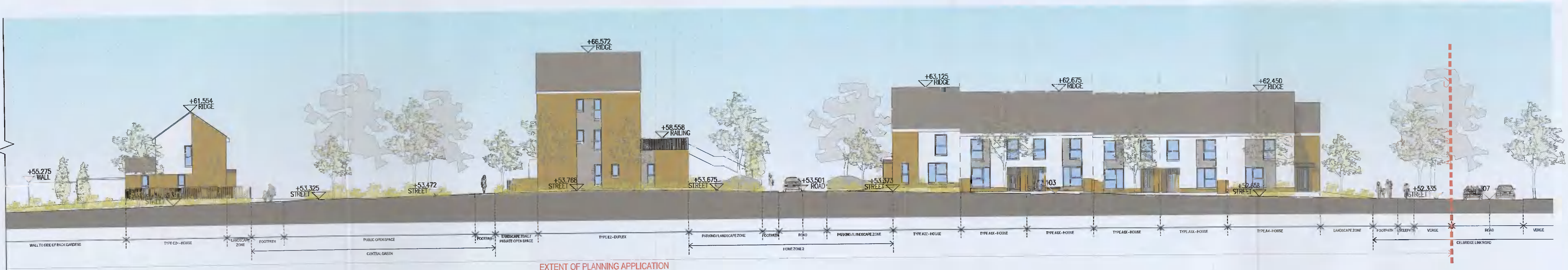
6-6B Proposed Street Elevation 1:200 @ A1