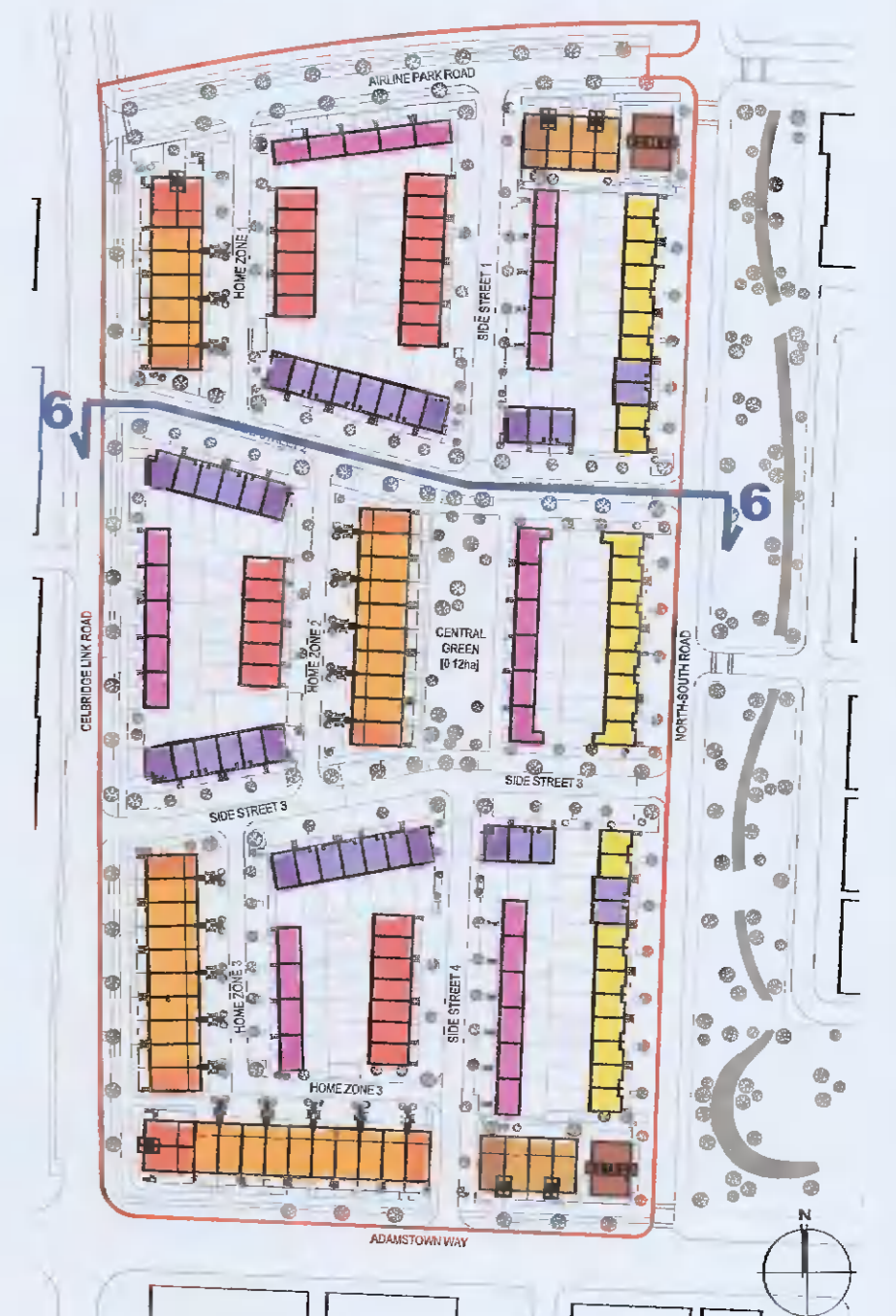
00 Keyplan Not to scale