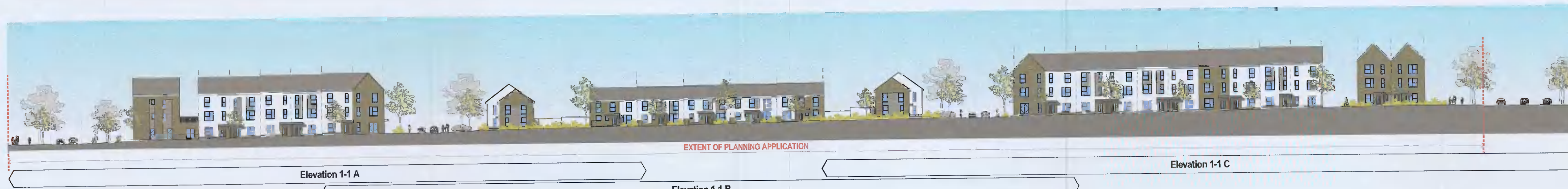
1-1 Proposed Street Elevation 1:500 @ A1 CELBRIDGE LINK ROAD