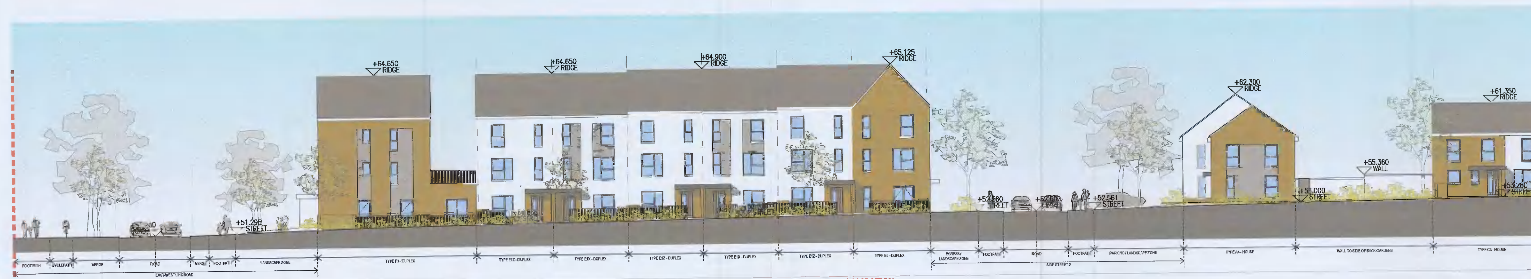
1-1A Proposed Street Elevation 1:200 @ A1