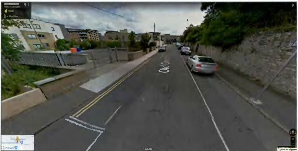
Figure 4-1: Old Greenhills Road (Looking into the existing site entrance)

Main Road, Old Greenhills Road and the R819 are to remain open during the course of the works. The Main Contractor will be responsible for all site access and works activity and must ensure the continued operation of Main Road, Old Greenhills Road and the R819. It is proposed that construction vehicles will primarily access the site via the Old Greenhills Road entrance. Refer to Figure 4-2 for illustration.