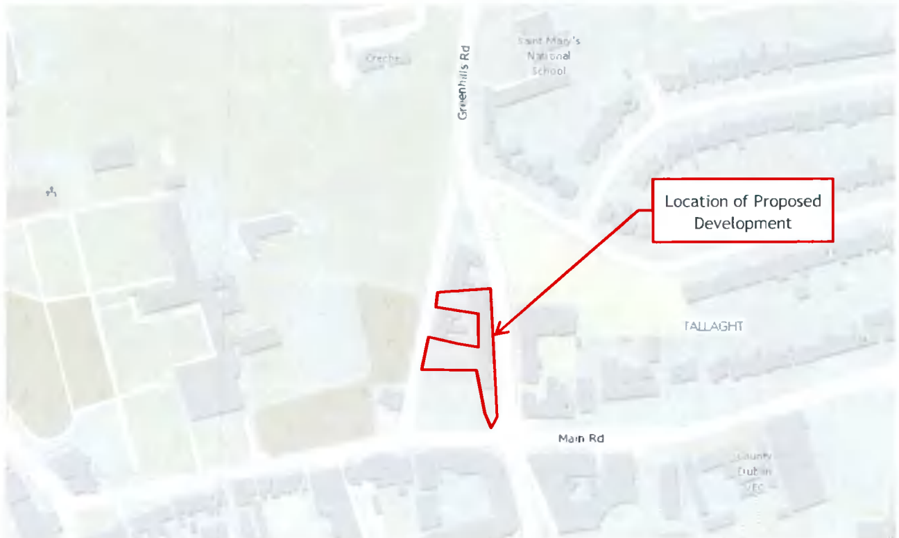
Figure 1-1: Site Location of the Proposed Development

This report was prepared for SDCC in relation to the proposed development and deals specifically with the Outline Construction and Demolition Waste Management Plan.