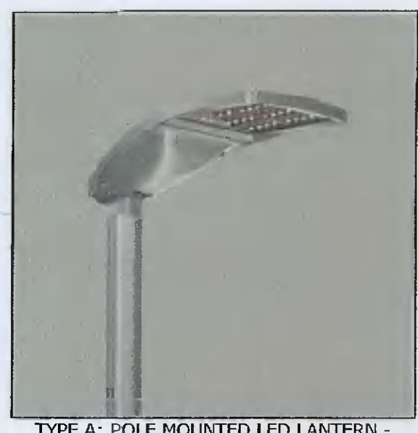
TYPE A: POLE MOUNTED LED LANTERN - IGUZZINI WOW