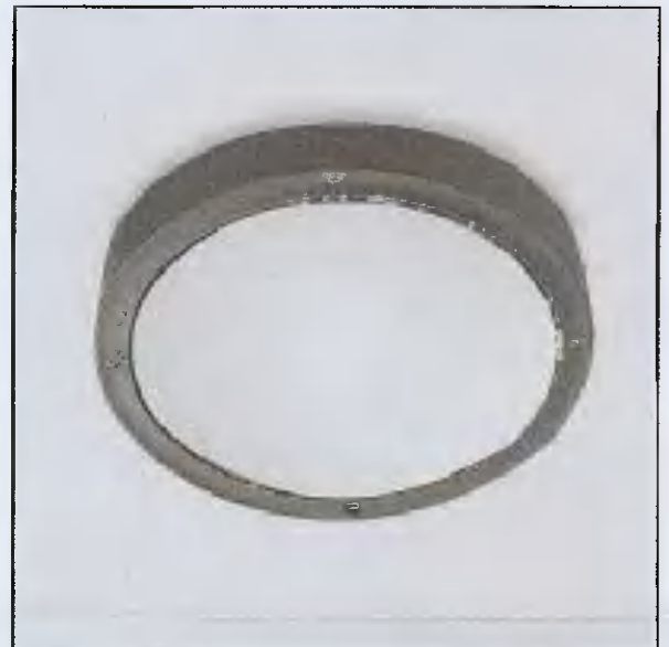
TYPE C: LED SURFACE MOUNTED FITTING - LEDS-C4 BASIC ALUMINIUM