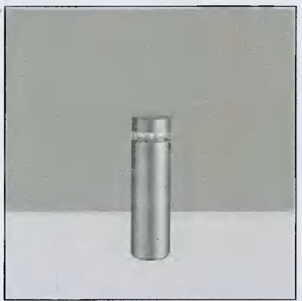
TYPE H: 600mm BOLLARD FITTING - IGUZZINI INWAY