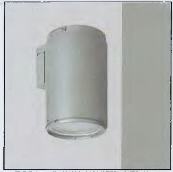
TYPE B: LED WALL MOUNTED FITTING - IGUZZINI IROLL