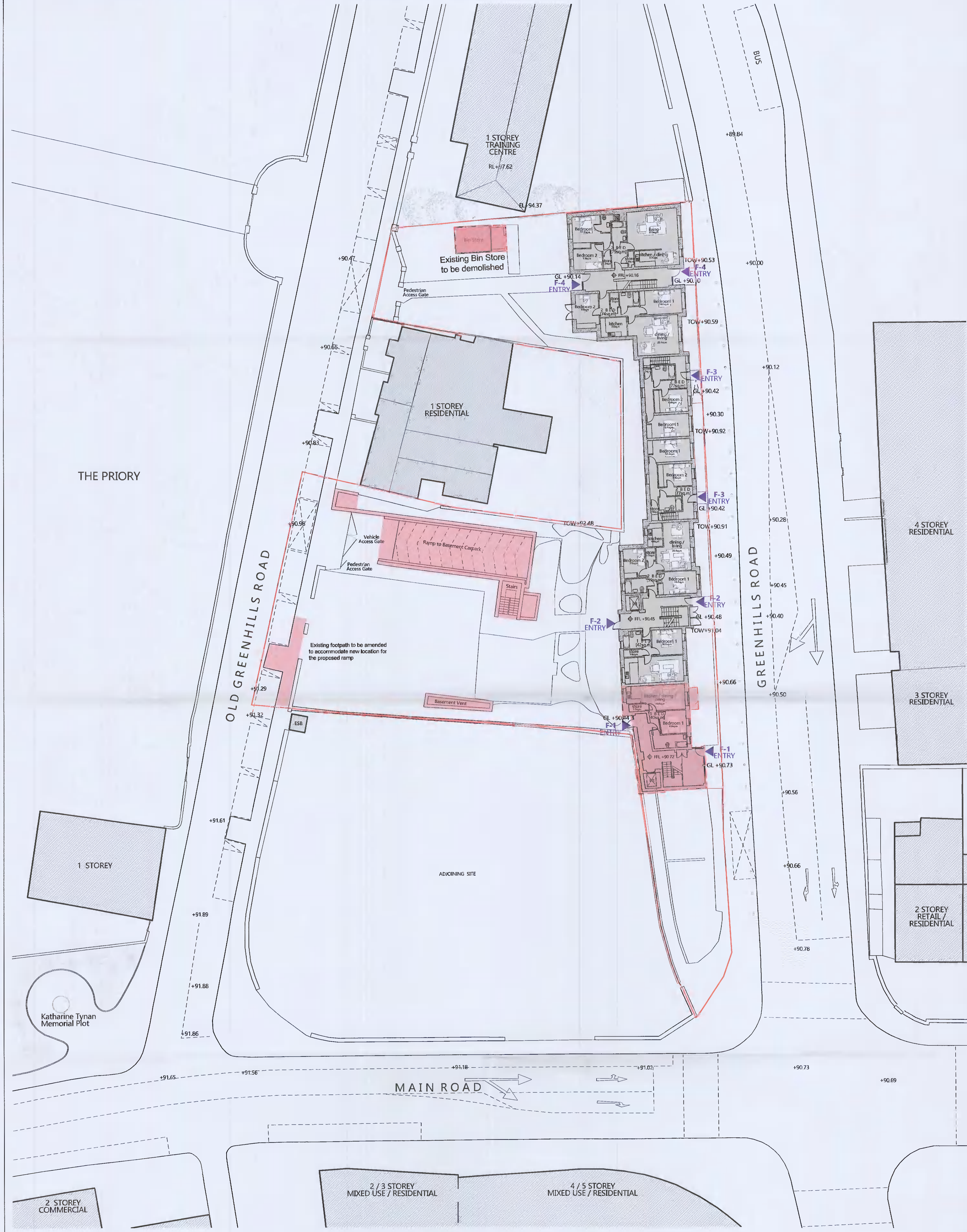
1 EXISTING GROUND FLOOR PLAN PA-201 Scale: 1:200

COPYRIGHT: The design and details shown on this drawing are applicable to their project only and may not be reproduced in whole or in part or be used for any other project or purpose without the written permission of TOT Architects with whom copyright resides. DO NOT SCALE from this drawing. Use figured dimensions. Contractor to check all dimensions on site prior to commencement of works. Any discrepancies are to be referred to the ARCHITECT.