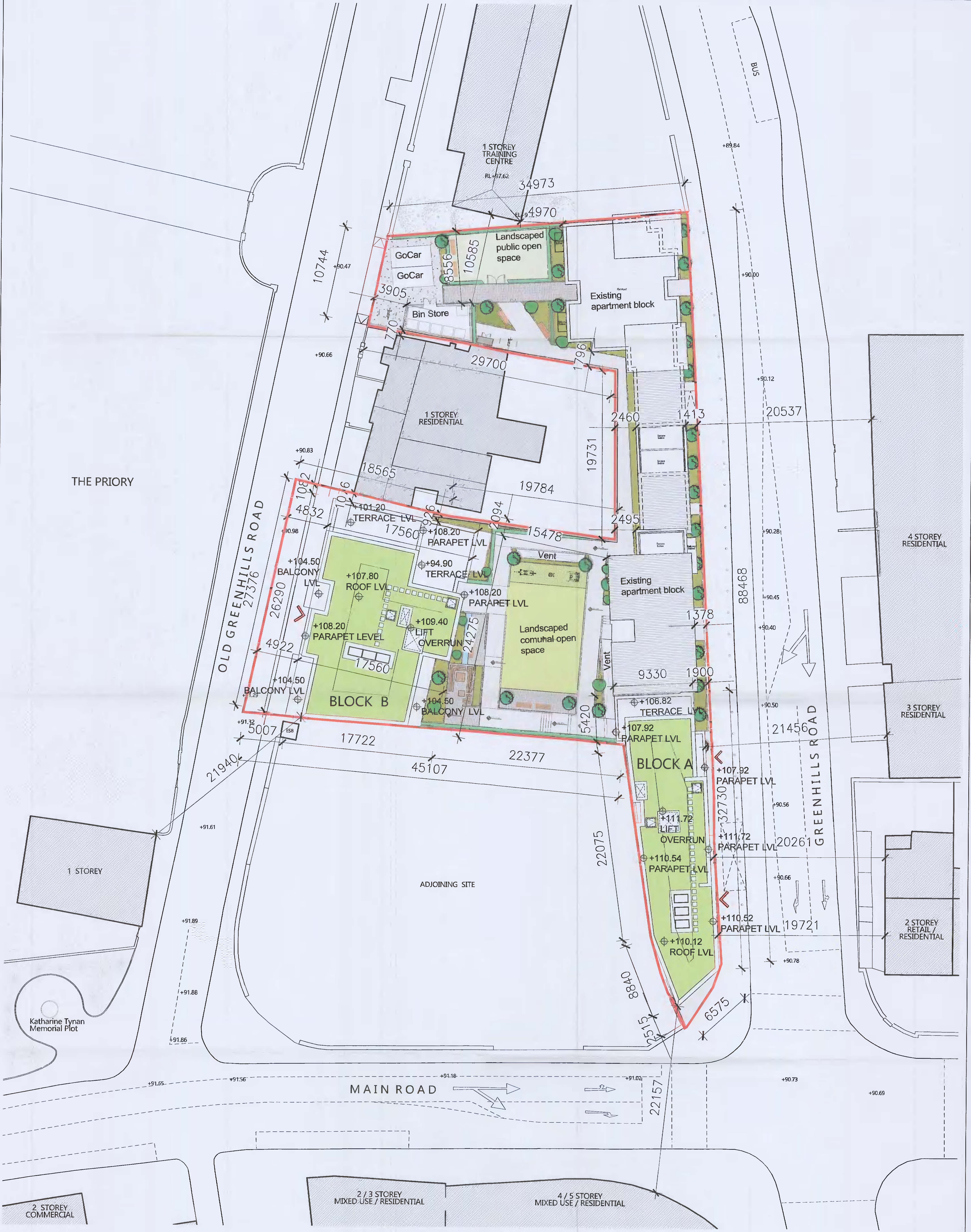
1 SITE PLAN PROPOSED PA-102 Scale: 1:200

COPYRIGHT: The design and details shown on this drawing are applicable to their project only and may not be reproduced in whole or in part or be used for any other project or purpose without the written permission of TOT Architects with whom copyright resides. DO NOT SCALE from this drawing. Use figured dimensions. Contractor to check all dimensions on site prior to commencement of works. Any discrepancies are to be referred to the ARCHITECT.