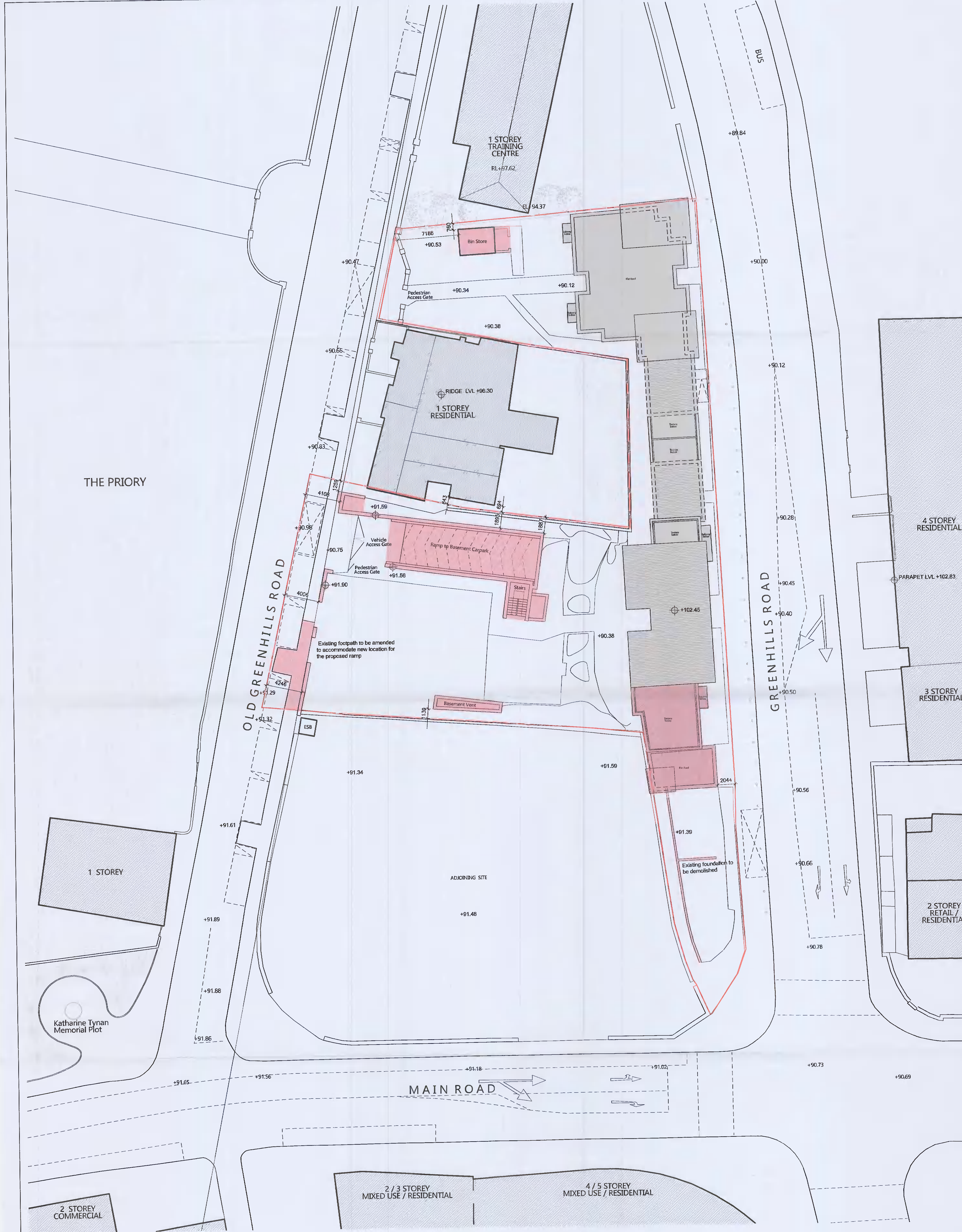
1 EXISTING SITE PLAN PA-101 Scale: 1:200

COPYRIGHT: The design and details shown on this drawing are applicable to their project only and may not be reproduced in whole or in part or be used for any other project or purpose without the written permission of TOT Architects with whom copyright resides. DO NOT SCALE from this drawing. Use figured dimensions. Contractor to check all dimensions on site prior to commencement of works. Any discrepancies are to be referred to the ARCHITECT.