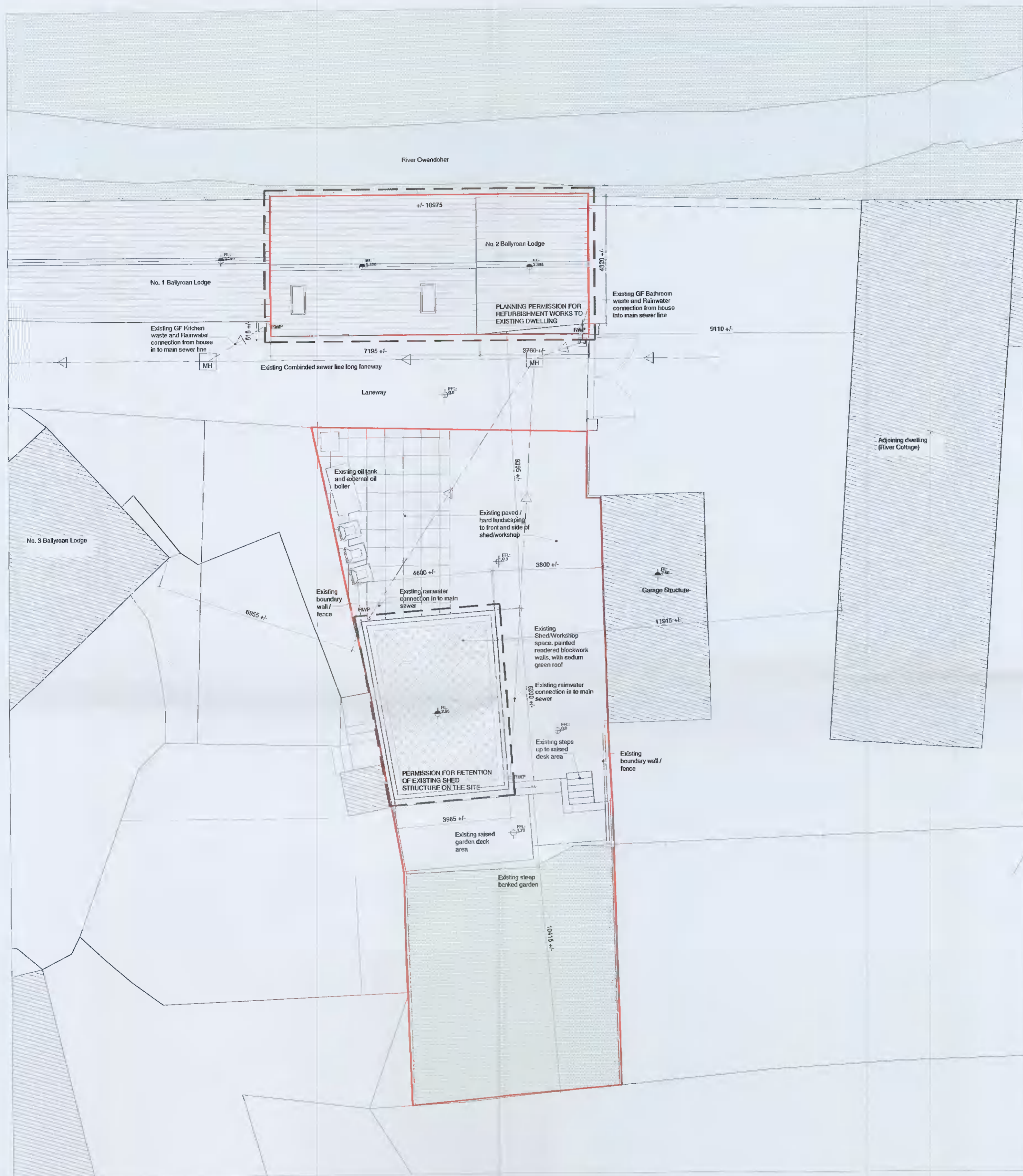
Existing Site Layout scale: 1:100