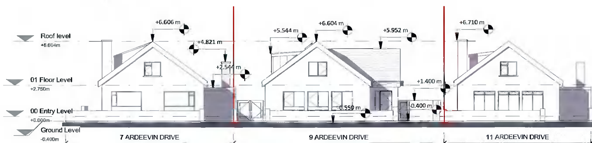
3 Contiguous street elevation - Proposed (no colour shading) 1 : 200