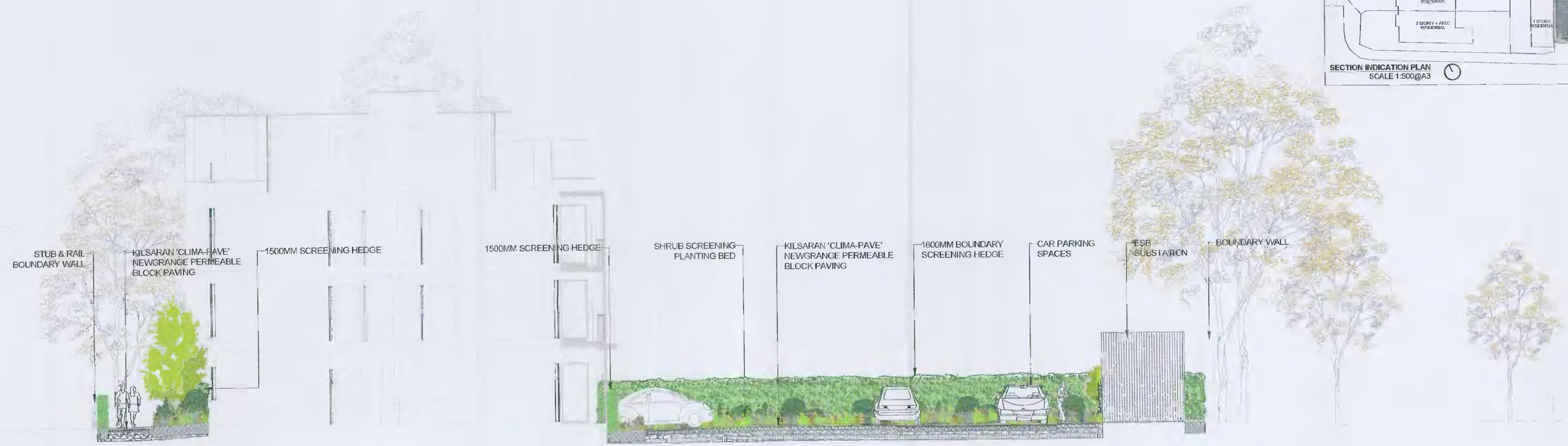
SECTIONAL ELEVATION A-AA SCALE 1:100@A1