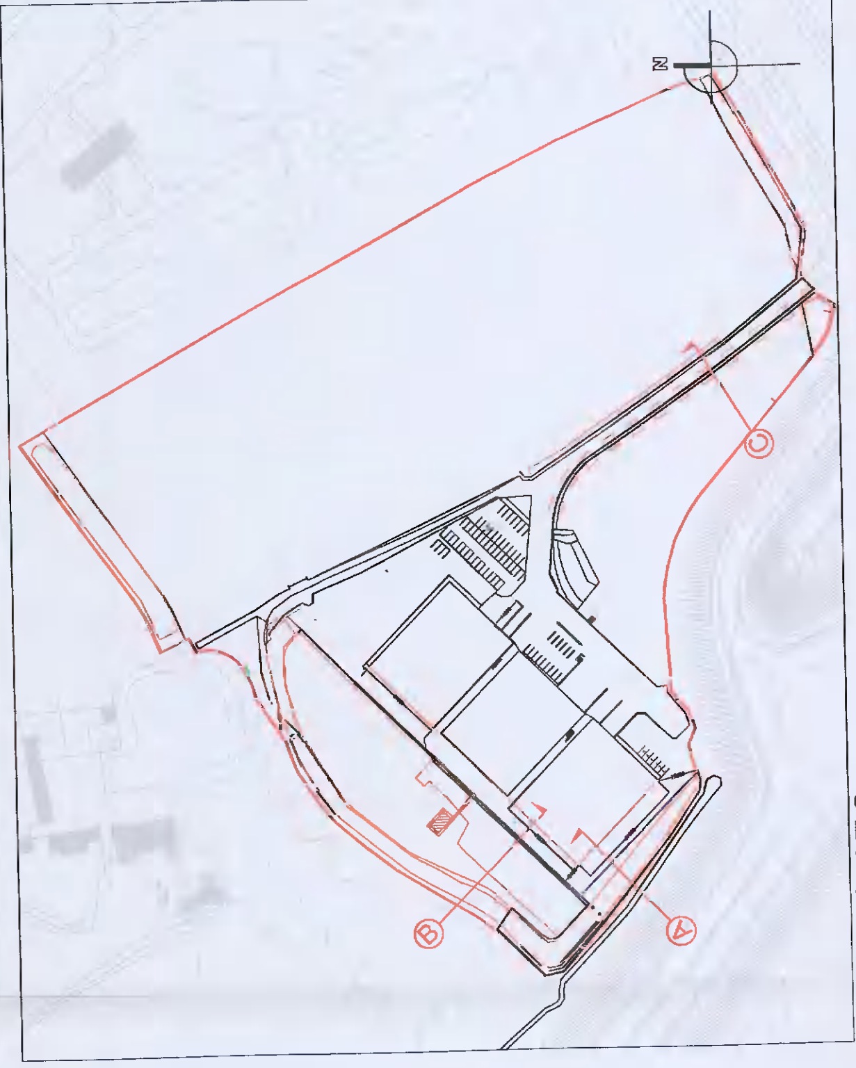
Key Plan | N.T.S.