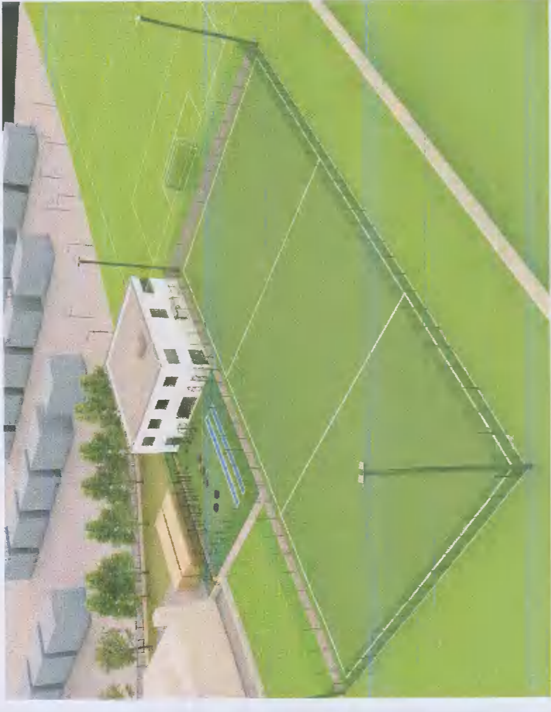
4 3-D Image A scale n/a

Drainage - Mains Foul Drainage - Mains Surface Mains Water (Irish Water)