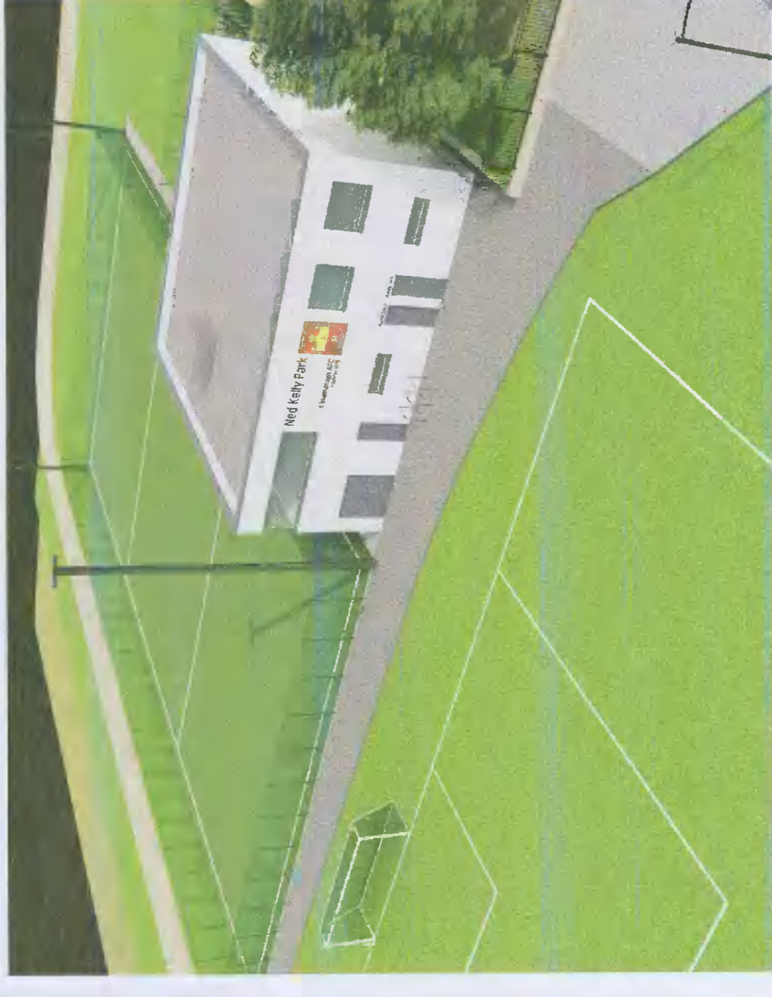
5 3-D Image B scale n/a

Proposed Site Plan; Proposed Site Sections; 3-D Images